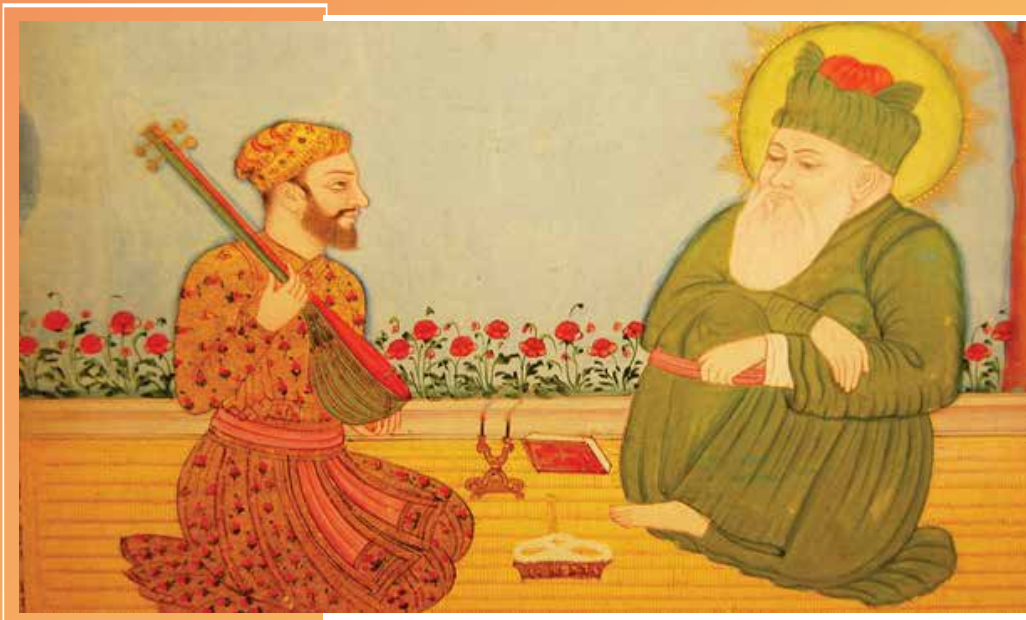
Amir Khusrau's Musical Sonnets